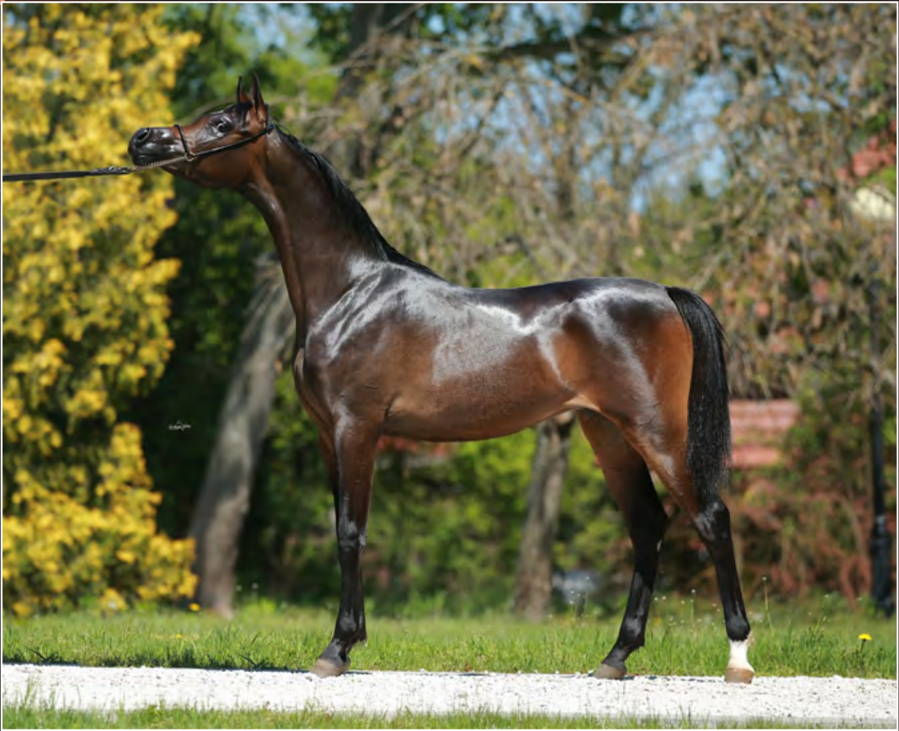
Ferrum (Morion x Ferrmaria) by El Omari

Martynika his show and performance career was cut short, but his offspring has proven his value as a sire with Emdrona (out of Elgora/Poganin) named 2017 Bialka Spring Show Junior Silver Champion and Polish National Junior Gold Champion.