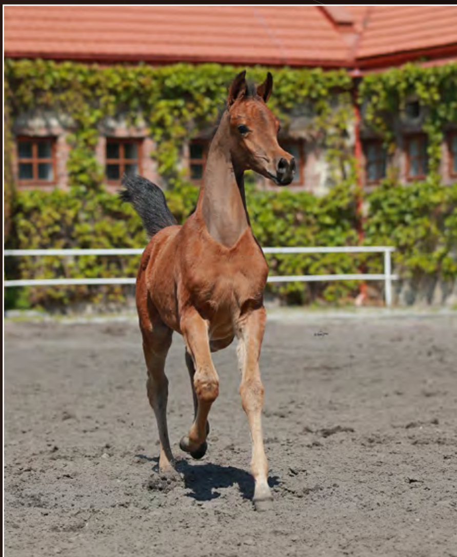
Emiremia (Morion x Emblema)

was named Polish National Gold and Silver respectively with El Medida as Best in Show. El Brillo was named the Polish National Silver Junior Champion.