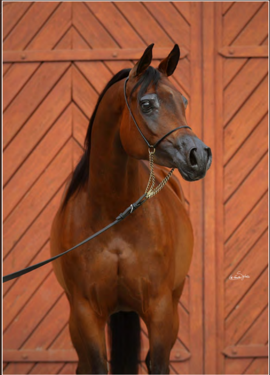
Forga ( Morion x Forgissima )

Michałów and Al Thumama stud that Morion would be on lease to them for the 2015/2017 season. In the fall of 2015 he was shown in Aachen winning the Junior Champion title and in Verona he was European Junior Top Five Stallion.