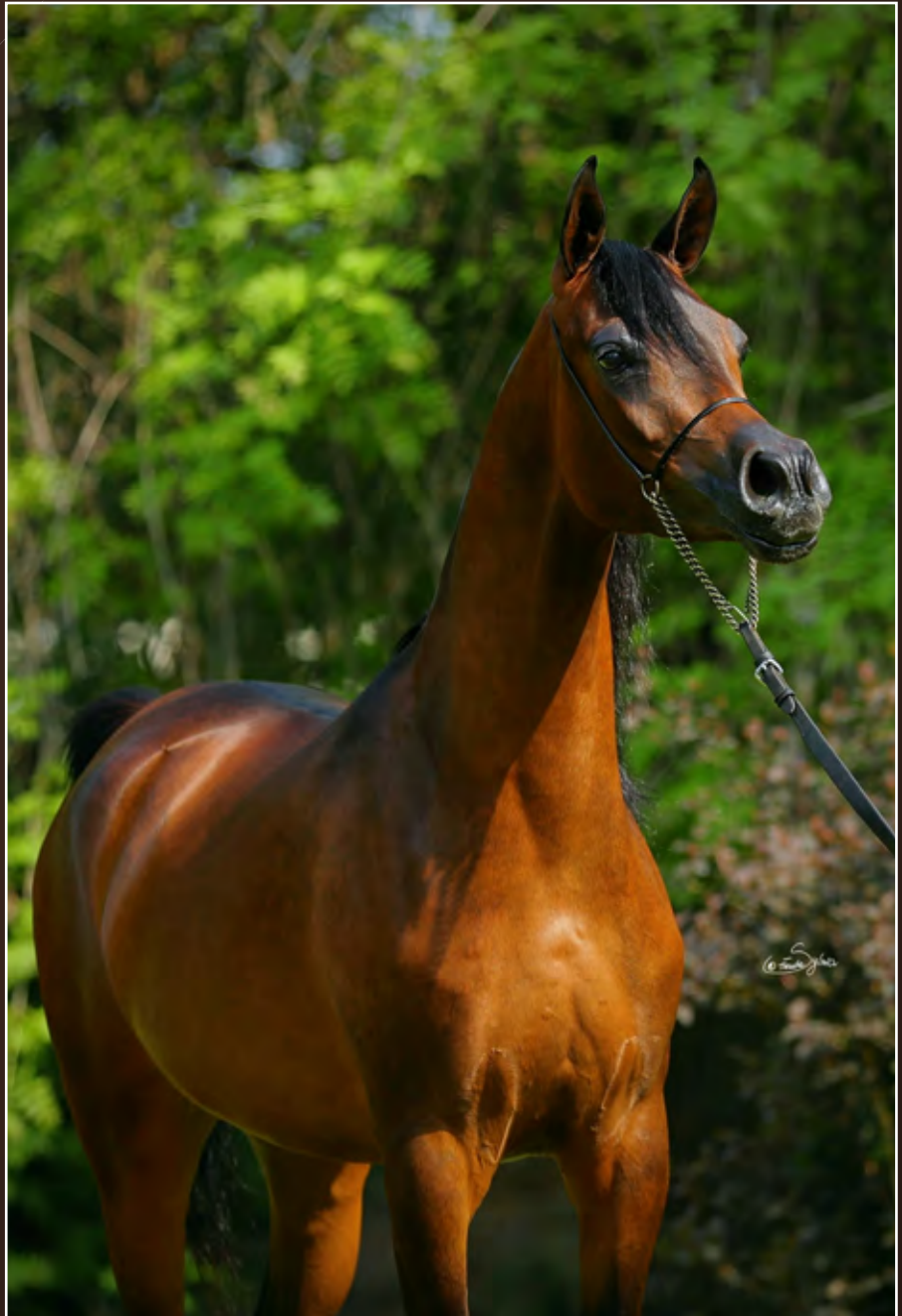
Wespera (Morion x Wógeza)

El Maestro (out of El Medonia/Shanghai EA) was 2021 Białka Spring Show Yearling Gold Champion and Polish National Bronze Yearling Champion, El Mariella (out of El Marina/Ganges) 2021 Białka Spring Show Yearling Gold Champion and El Medida was Białka Spring Show Gold Junior Champion and Classwinner at the Menton show .