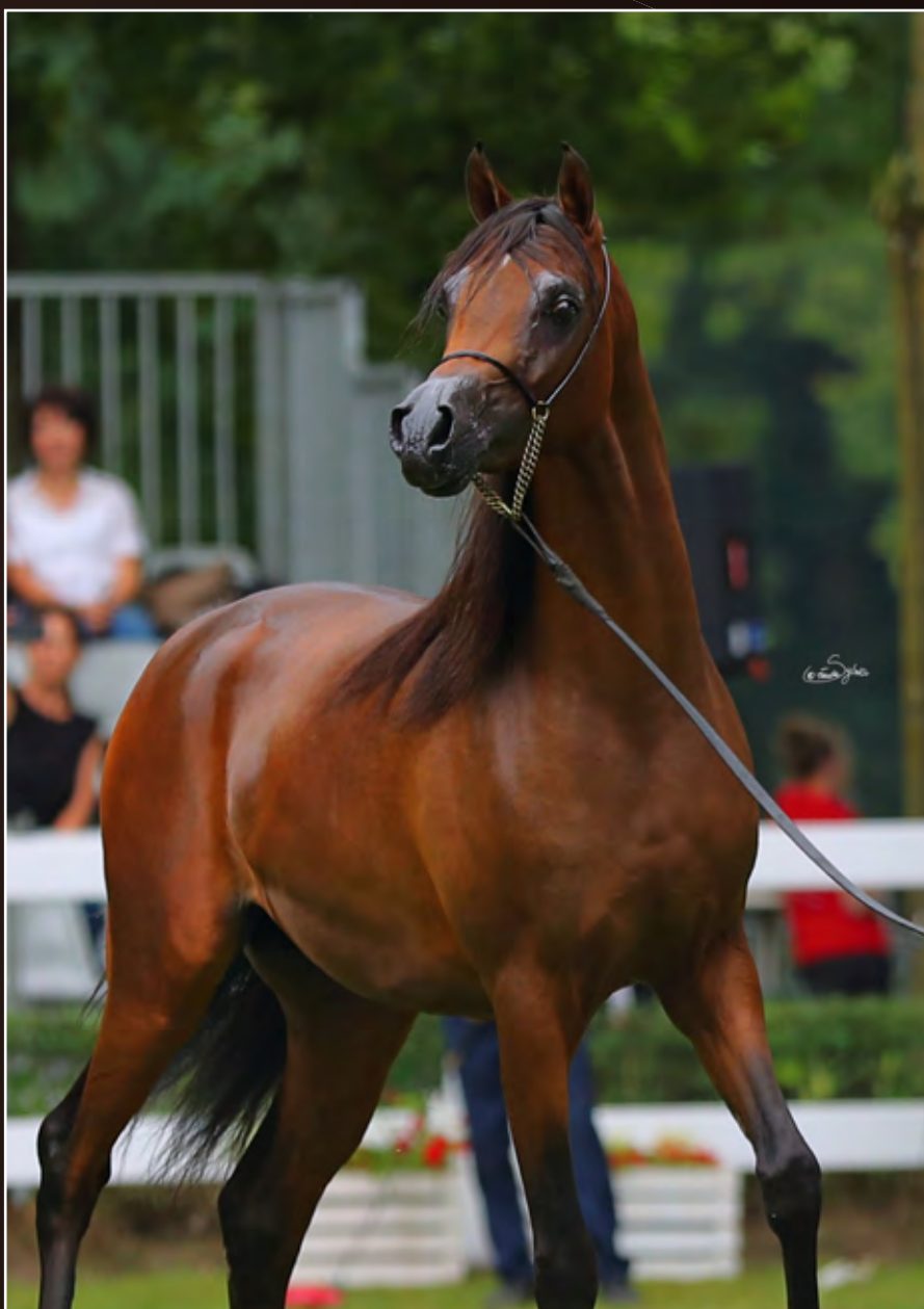
El Brillo (Morion x El Larinera)

International B-show, Gold AHO World Cup Chantilly, Silver Champion Elran Cup and All Nations Cup Silver Champion.