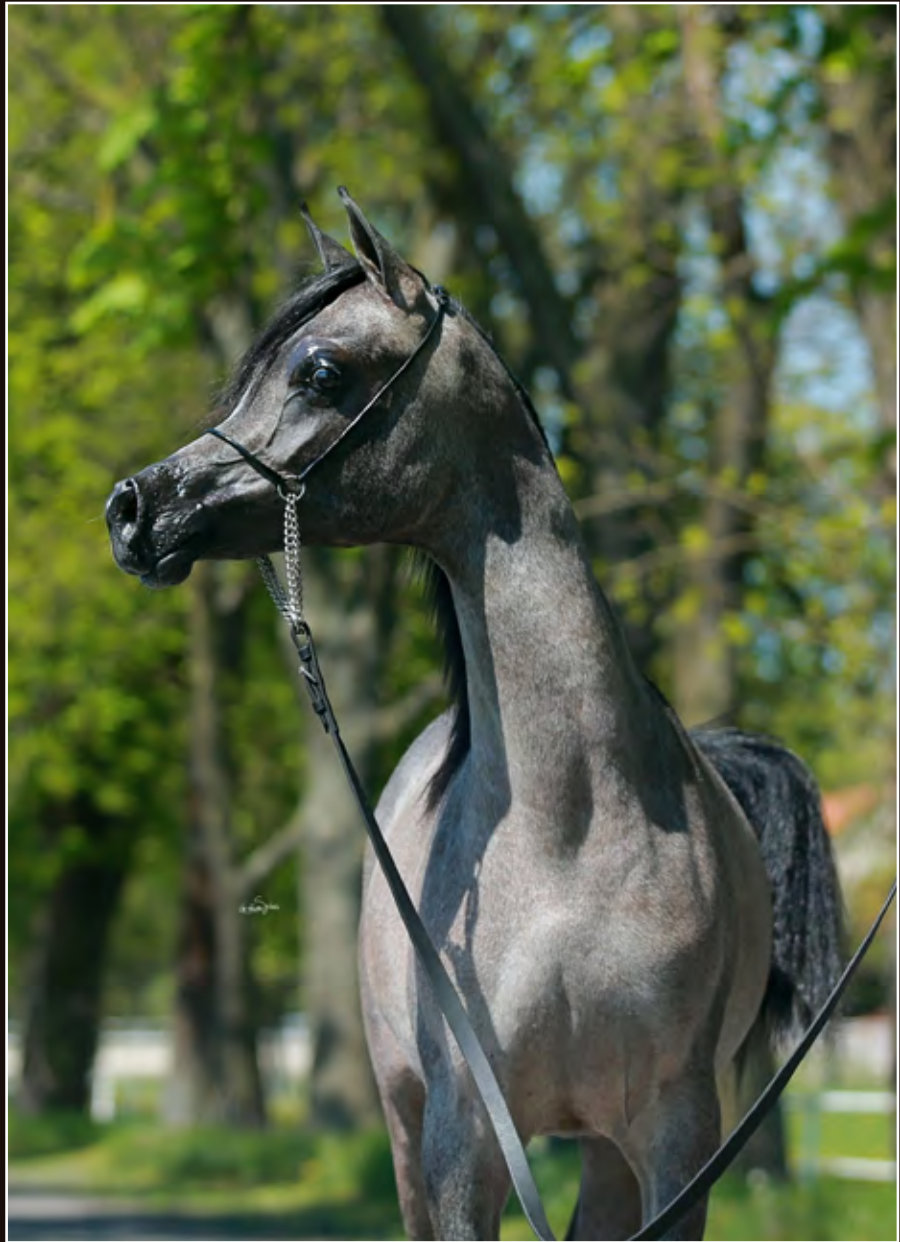
El Madera (Morion x El Medonia)

crop there was outstanding. Mesalina gave birth to a bay colt named Morion and he was spectacular. The same year Janów Podlaski got Al Jazeera (out of Alhasa/Ganges), Alsa (out of Alameda/Wachlarz), Burza (out of Bursa/Aslan), Pitawal (out of Pepita/Ekstern) and Prometida (out of Panonia/Eukaliptus), and Michałów had Parmania (out of Parmana/Al Maraam), Pusytnia Kahila (out of Pustynna Malwa/Ekstern) and Wadi Kahil (out of Wadi Halfa/Ekstern). The cross with Kahil on Ekstern/Ganges-daughters were genius and it was clear that Kahil was a perfect match for the Polish mares.