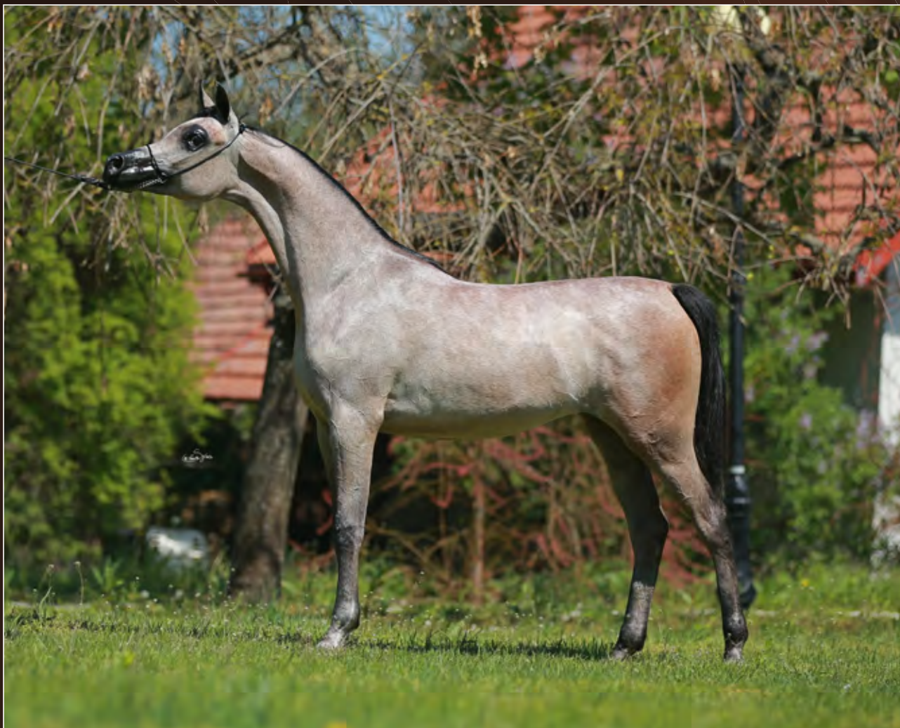
El Medida (Morion x El Medara) by Shanghai E.A.

Morion had his debut at the Bialka Spring show and he was Junior Spring Show Gold Yearling Champion and Best in Show following up with the Polish National Junior Champion title in August on Al Khalediah European Horse Festival Junior Champion Stallion and Best in Show the following weekend. At all 3 title shows in the fall - All Nations Cup, European Championship and World Championship did he claim the Silver Yearling Champion title.